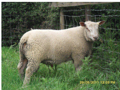
Rainbow Led Zeppelin

Sire's Sire XPU7009 Rainbow House of Letterawe Dam's Sire DG9400 Foulrice Javelin