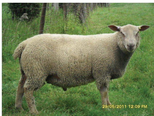
Rainbow Last Shadow Puppet