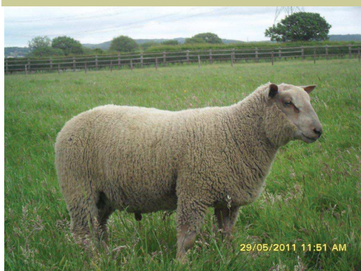
Rainbow Linkin Park 11XPU00600